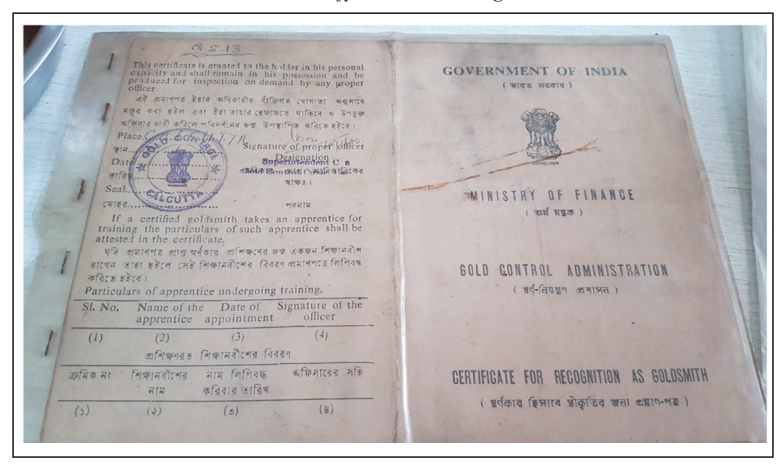
Figure 2 Licence to certify an artisan as a goldsmith