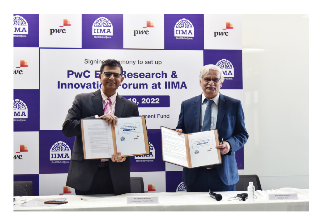
Launch of PwC ESG Forum @ IIMA

IIMA, in collaboration with PwC India, announced the establishment of the 'PwC ESG Research Forum' on December 19, 2022. The purpose of this forum is to facilitate the exchange of knowledge and ideas among ESG stakeholders through a series of marquee events hosted by the Centre. This initiative is a contribution to India's commitment to the net zero agenda and upcoming BRSR regulations, with the aim of expanding and deepening the sustainability impact in the Indian industry.