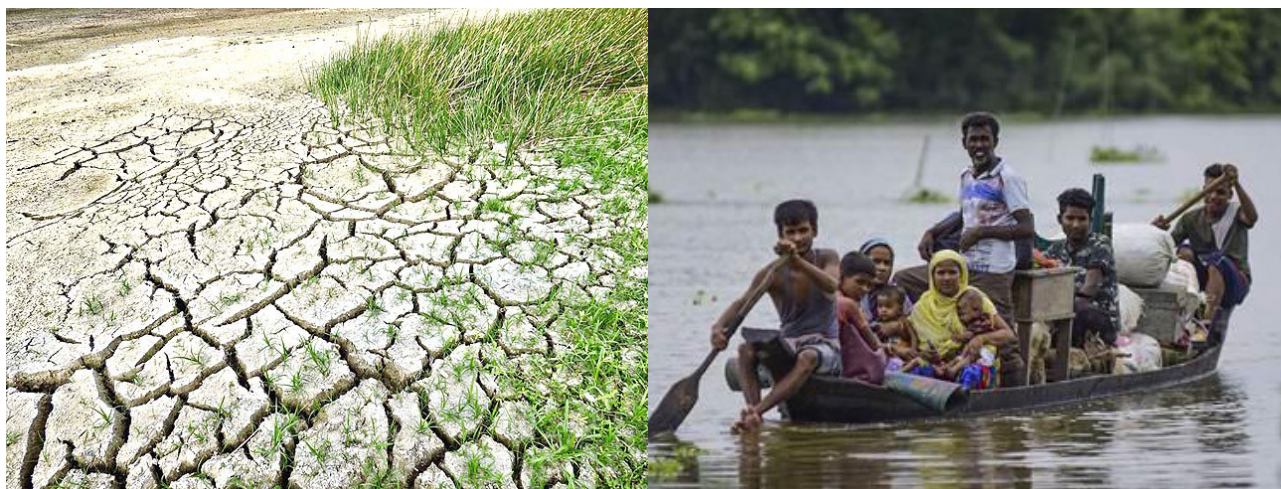
Figure 1: Drought and Subsequent Floods in Bihar in September 2019.