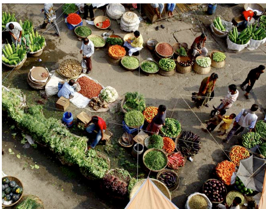
Vegetables are laid out for sale at an open air market in Dhaka, Bangladesh

Vertical integration of business between the farmer and the retailer is increasingly common in agri-business. Contract farming is a form of vertical integration where the buyer and farmer agree conditions for producing and marketing farm products. Typically the farmer agrees to produce a certain quantity of output, meet quality standards and a delivery schedule. The contract also sets a price or price range to be met. Sometimes the buyer insists on particular inputs and production techniques. Critics of contract farming argue that smaller farmers are often unable to negotiate fair terms of trade themselves and that it is not a transformative approach. Others argue that the relationship is not exploitative if managed properly. Sometimes contract farming can be tapped as a vehicle for smallholder-led agricultural commercialization as it enables large buyers of farm produce to pool the outputs of several small farmers and harness economies of small-scale. Benefits to the farmer depend on the number of intermediaries between producer and final buyer and the buyer's contribution to the cost of inputs.