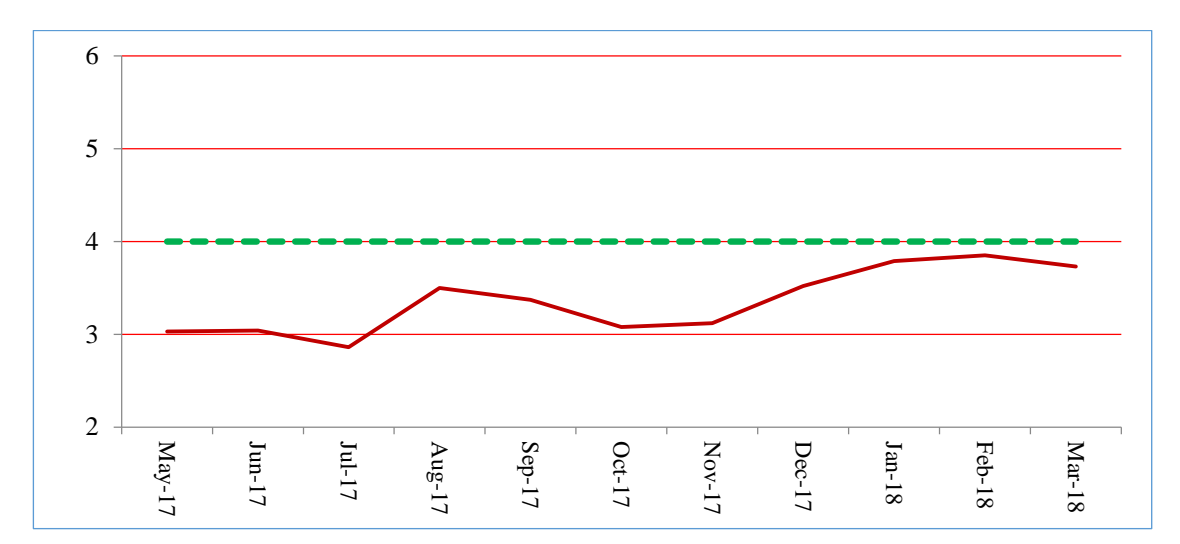
Chart 1: One year ahead business inflation expectations (%)